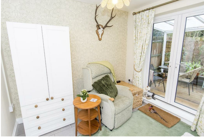
Bedroom Two 9'4" x 8'1" (2.84m x 2.46m)

UPVC double-glazed French doors to rear. Vertical radiator. Luxury vinyl tiled flooring.