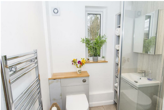
Shower Room 6'4" x 6'1" (1.93m x 1.85m)

UPVC double-glazed window to rear. WC. Wash hand basin over storage unit. Shower cubicle with Aqualisa shower. Luxury vinyl tiled flooring. Heated towel rail.